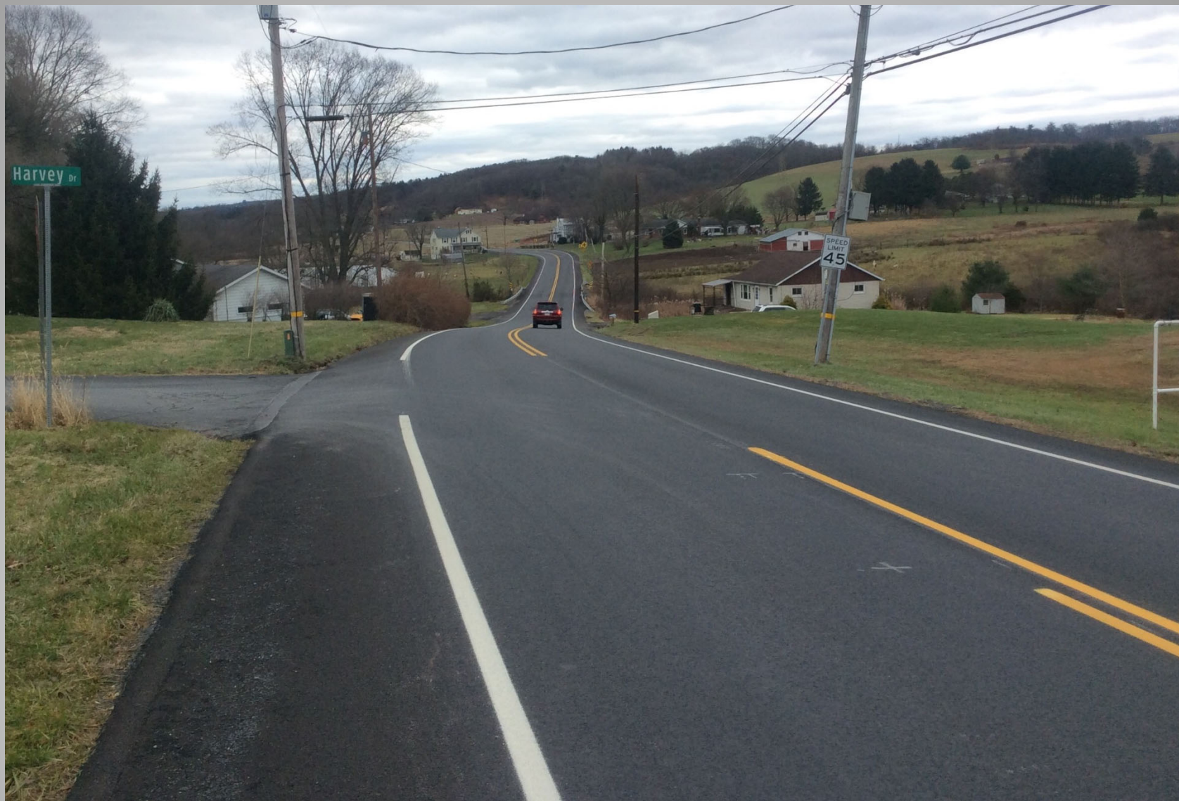
PennDOT District 5-0, New Enterprise Stone and Lime Co., Inc.