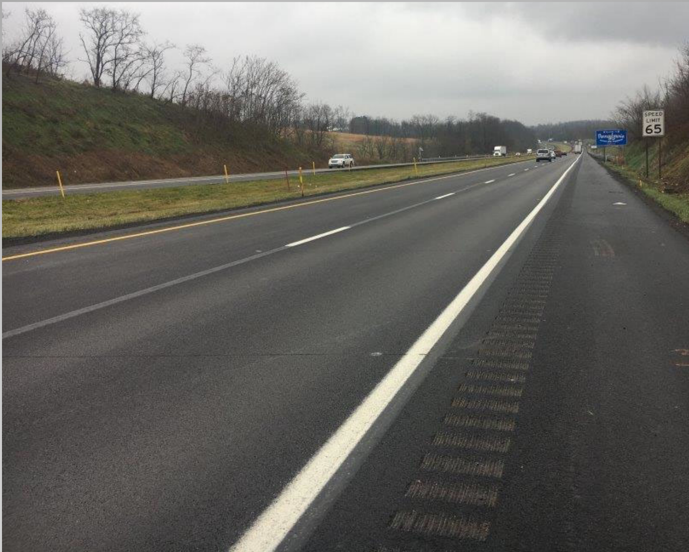
PennDOT District 12-0, Lane Construction