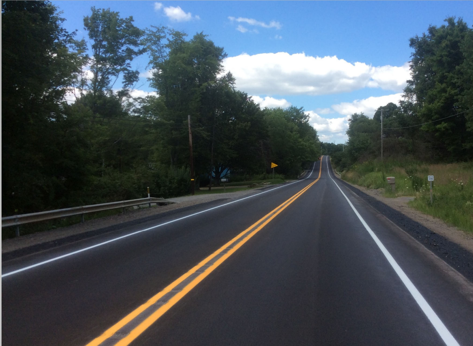
PennDOT District 10-0, Lindy Paving