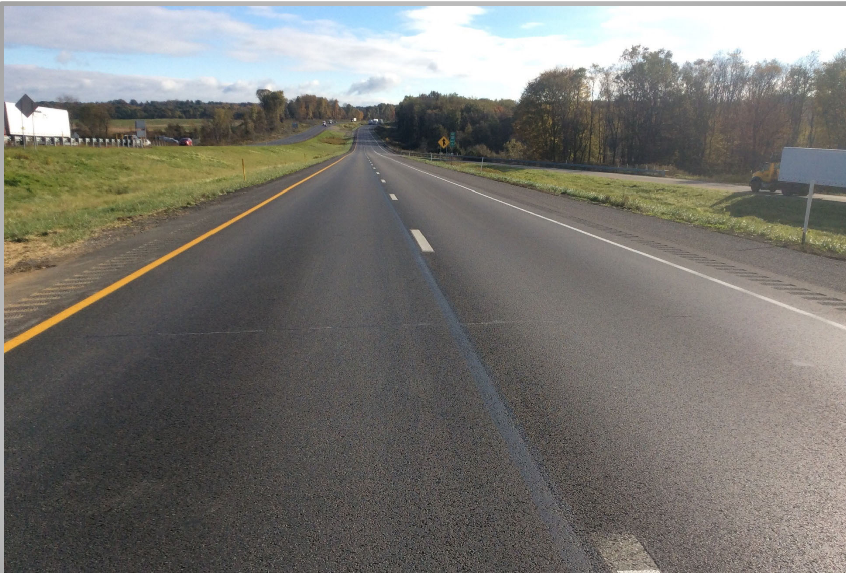
PennDOT District 1-0, Lindy Paving