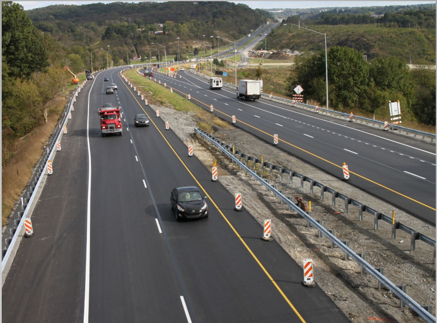
PennDOT District 11-0, Lindy Paving