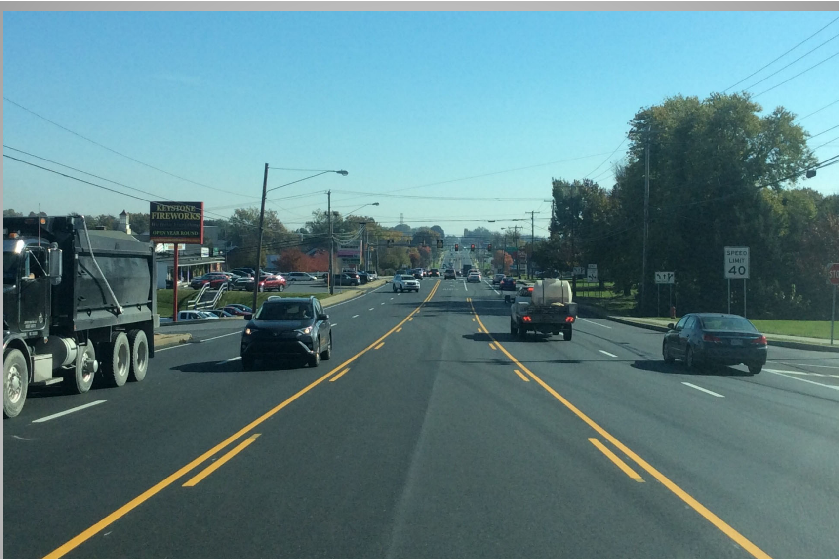
PennDOT District 8-0, New Enterprise Stone & Lime Co.