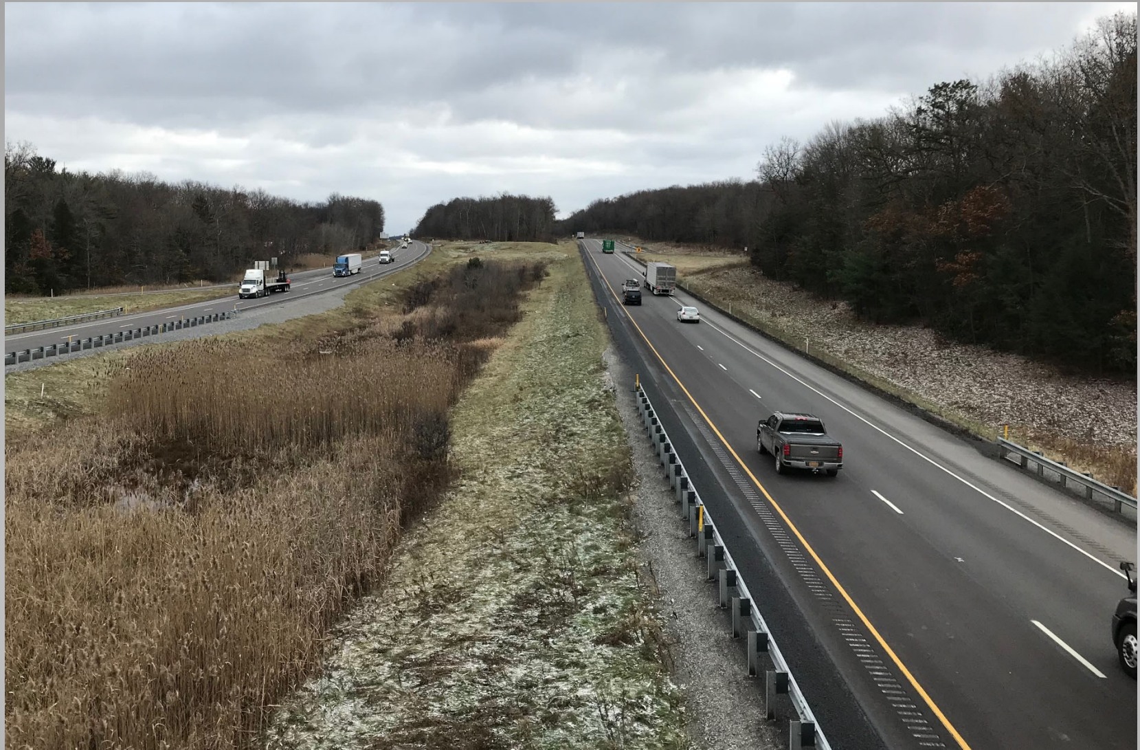
PennDOT District 2-0, HRI, Inc.