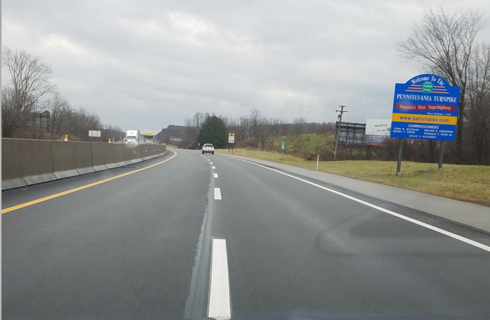
Pennsylvania Turnpike Commission, Lindy Paving