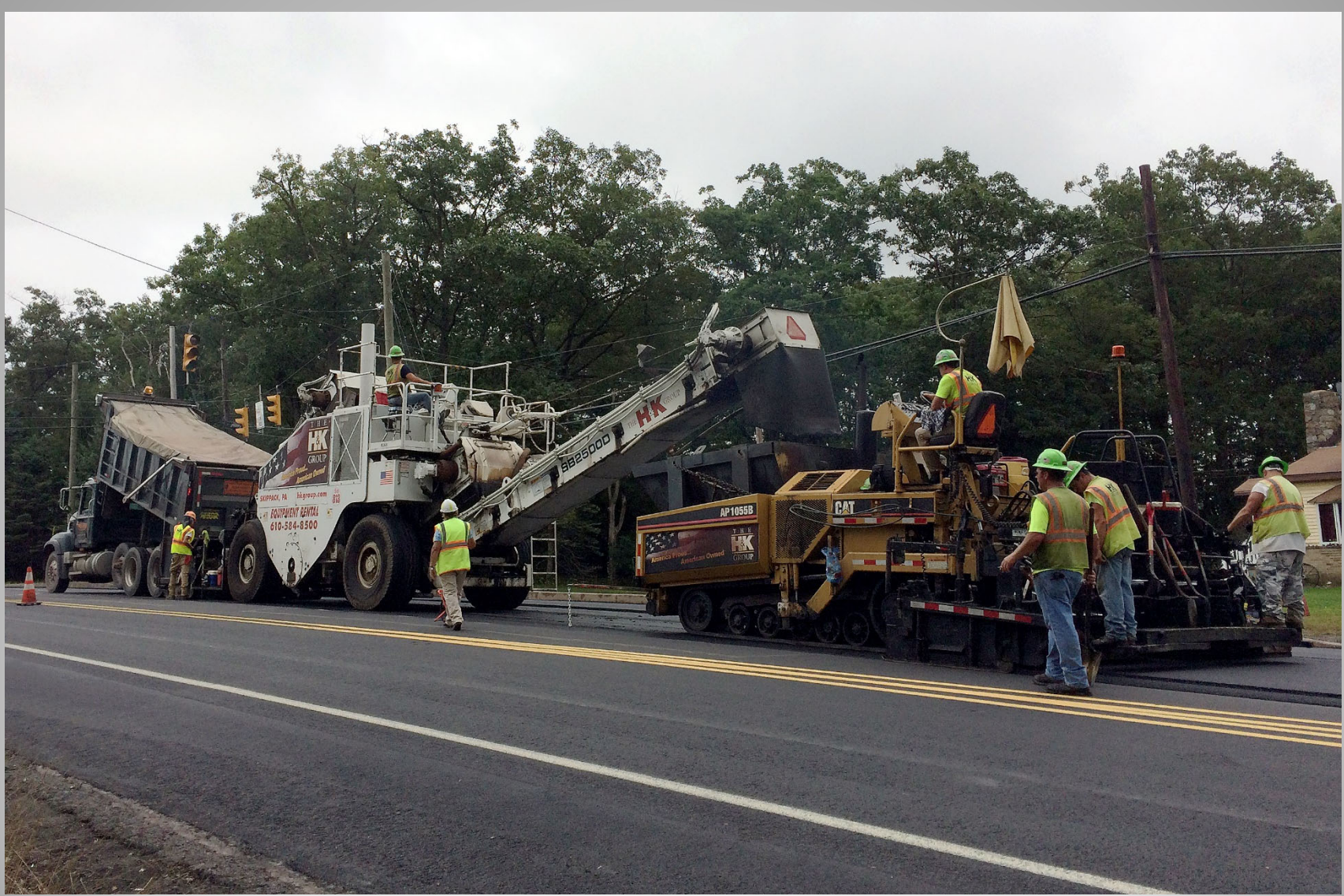
PennDOT District 4-0, The H&K Group